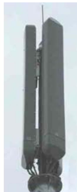
Antenna only shown (Without optional in-line TMA enclosure)