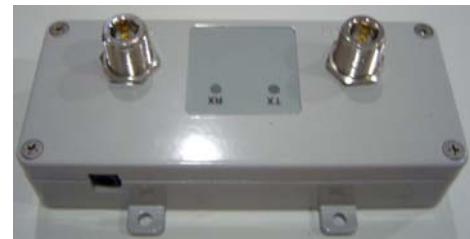
GXI Series with Built-In Current Injector