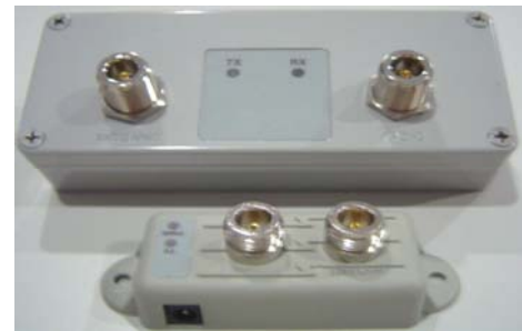
BDS Series with separated Current Injector

Amplifier GXI-BDS series are compatible with 802.11g (b/g) and 802.11b only (see below table); The 802.11g (b/g) model support 108Mbit/sec “ Turbo Mode” radios. Its active Power Control circuit automatically adjusts the amplifier’s gain to provide a constant output power.