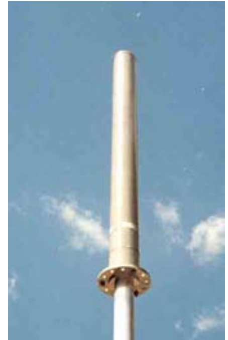
358MM MOUNTING FLANGE SHOWN